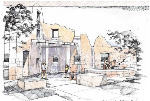
Interactive Water Features