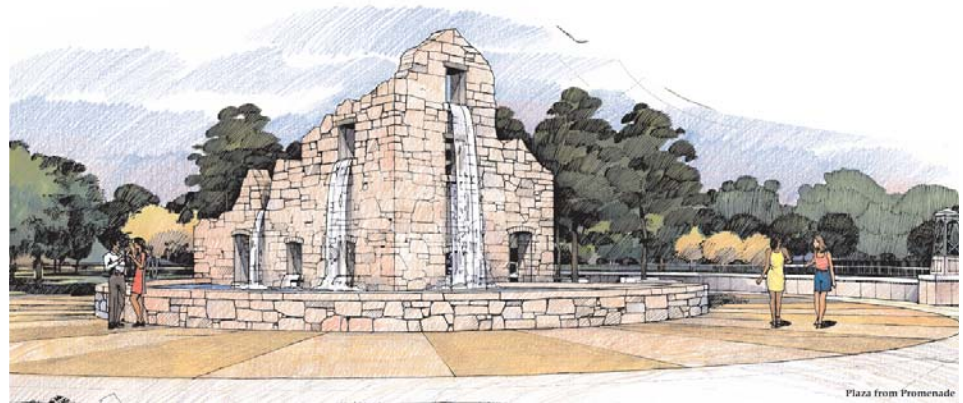
Plaza from Promenade