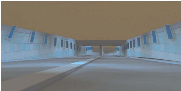
Lamar Underpass proposal (nighttime)