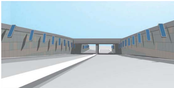
Lamar Underpass proposal (daytime)