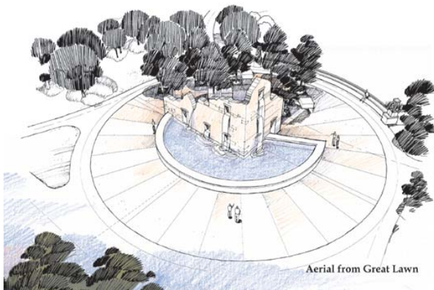
Aerial from Great Lawn